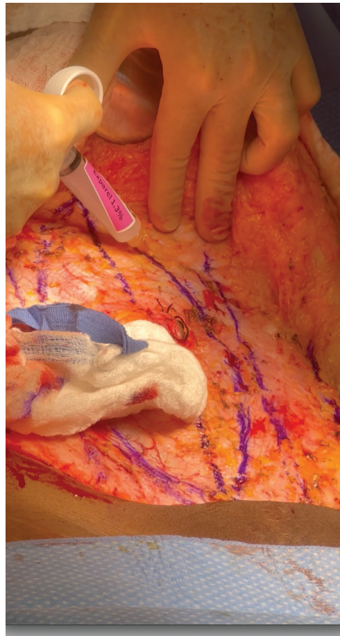
FIGURE 2. Infiltration of EXPAREL under the abdominal wall fascia.

To ensure complete analgesic coverage of the surgical site, Dr Rosen assumed that 1 mg of expanded EXPAREL would be infiltrated into the abdominal wall fascia for every 2 cm of surgical incision.